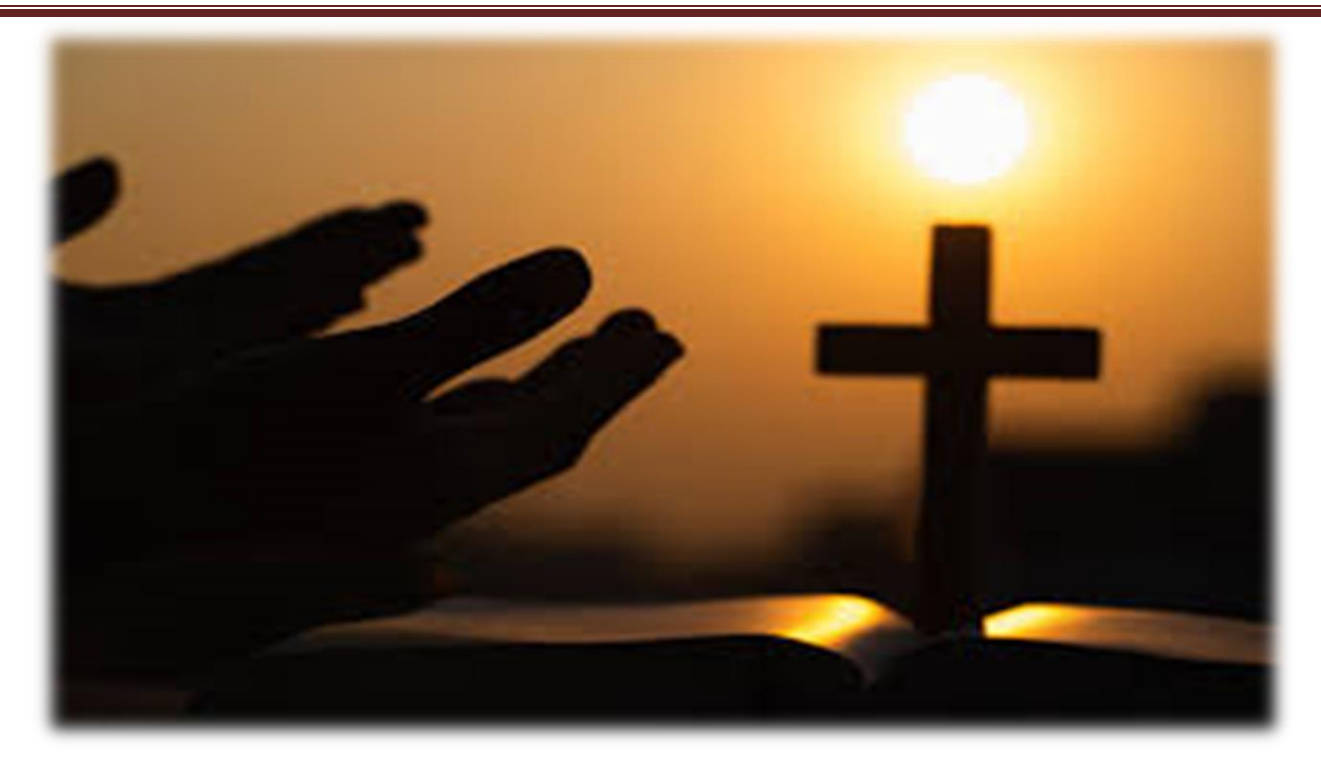
If we confess our sins, He is faithful and righteous to forgive us our sins and to cleanse us from all unrighteousness.